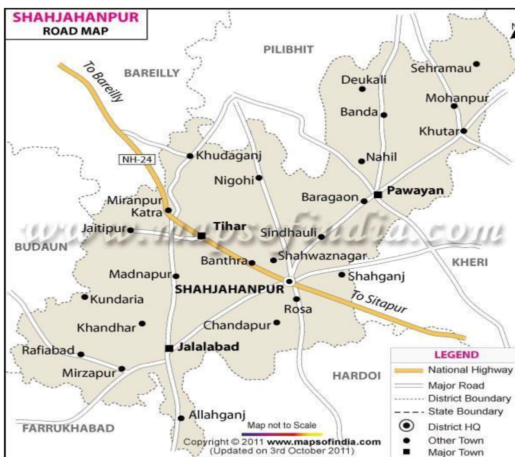
Figure 1.1. District Shahjahanpur map

To maintain the general administration of the district there is two additional district magistrate and revenue works and 5 sub-divisional magistrates for the assistance of district magistrate.